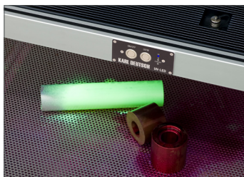
Inspection with the large area lamp under UV light