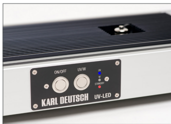
UV LED large area lamp operating panel