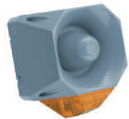
Asserta Sounder Beacon Grey